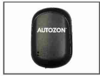
AZ RSR 44 Receiver