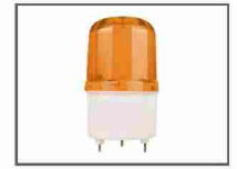
AZ AF LAC 19A Alarm Flash Lamp