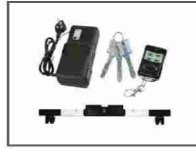
AZ RSEL 03 Electronic Lock