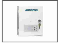
AZ RS3P 46 Phase Changer for 3 phase