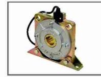
AZ RSSB 01 Safety Break