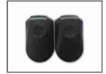
AZ RSPC 47 Photocell