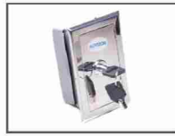
AZ RSKB 53 Key Box