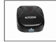
AZ RSRT PC 48 Photocell Receiver