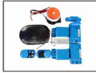
AZ RSWLSDS 05 Wireless Safety Edge Sensor