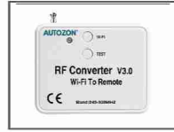
AZ WIFI 31 A Wifi Module