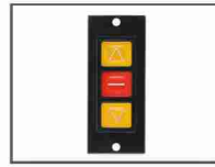
AZ RSPB 51 Push Button