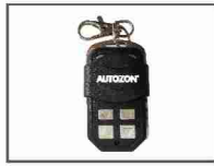
AZ RSR 45 Transmitter